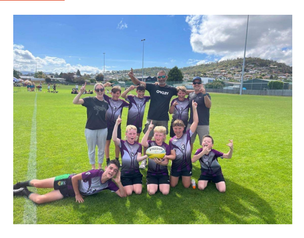
Congratulations to the Boys 12s Touch Football Premiers!